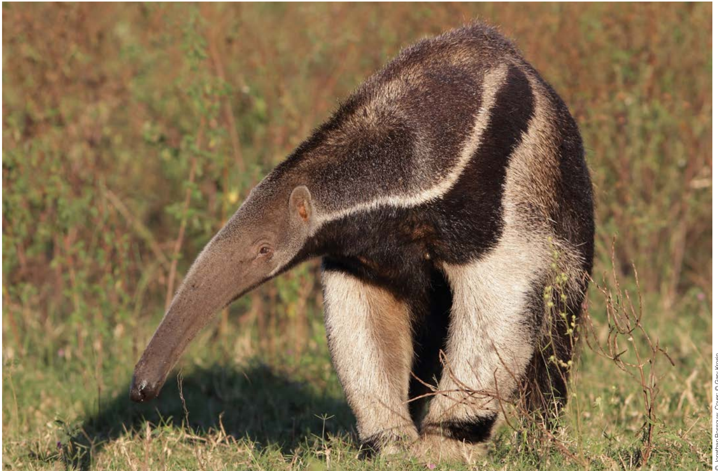
© Jonathan Rossouw, Cover: © Gary Krosin